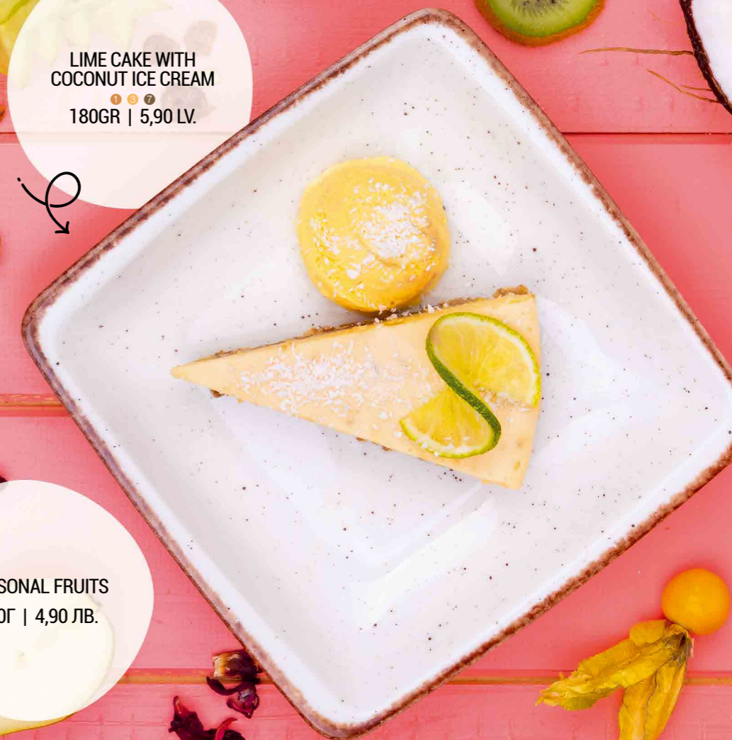
LIME CAKE WITH COCONUT ICE CREAM 180GR | 5,90 LV.