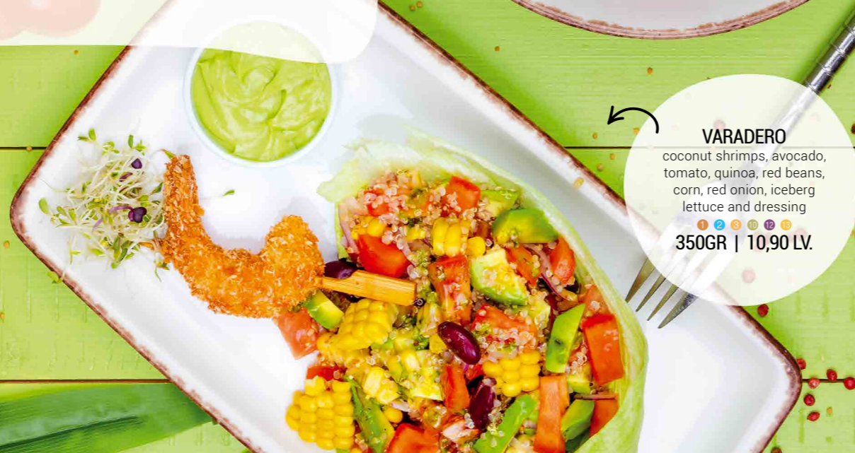
VARADERO coconut shrimps, avocado, tomato, quinoa, red beans, corn, red onion, iceberg lettuce and dressing 350GR | 10,90 LV.