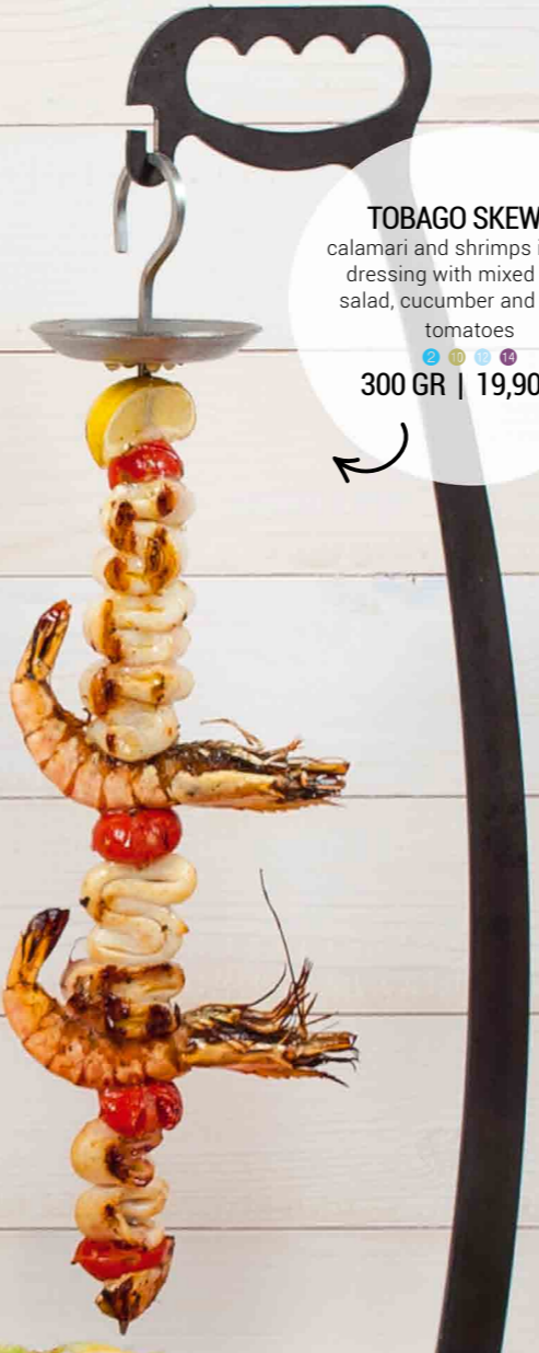
TOBAGO SKEWER calamari and shrimps in citrus dressing with mixed green salad, cucumber and cherry tomatoes 300 GR | 19,90 LV.