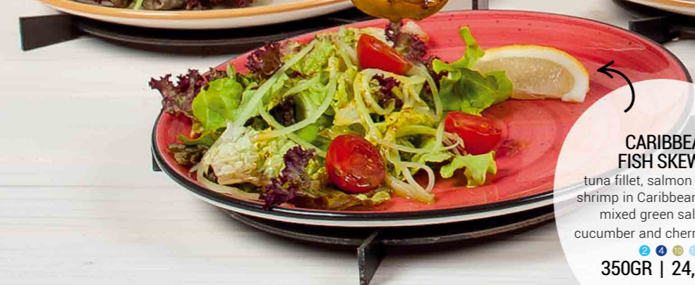
CARIBBEAN FISH SKEWER tuna fillet, salmon fillet, tiger shrimp in Caribbean marinade, mixed green salad with cucumber and cherry tomatoes 350GR | 24,90 LV.