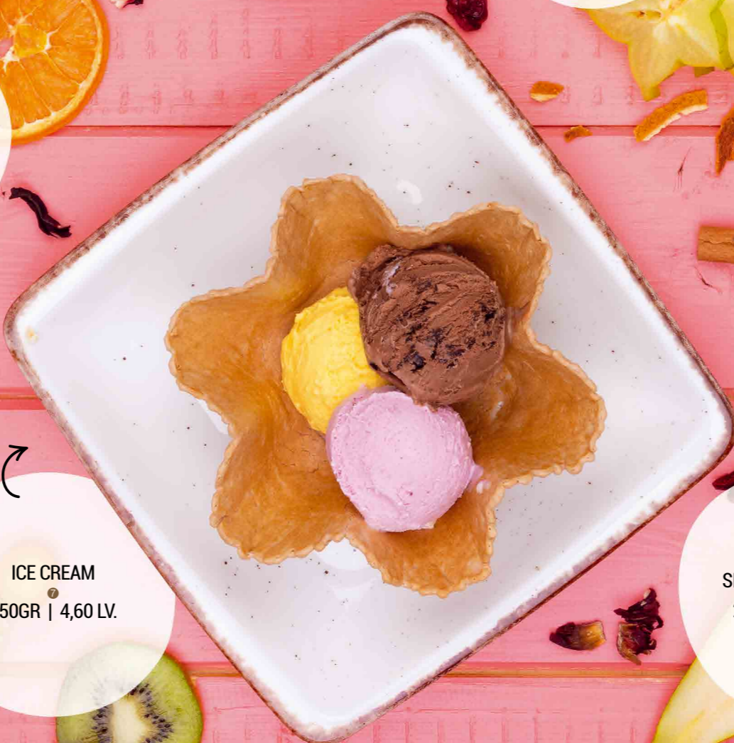
ICE CREAM 150GR | 4,60 LV.