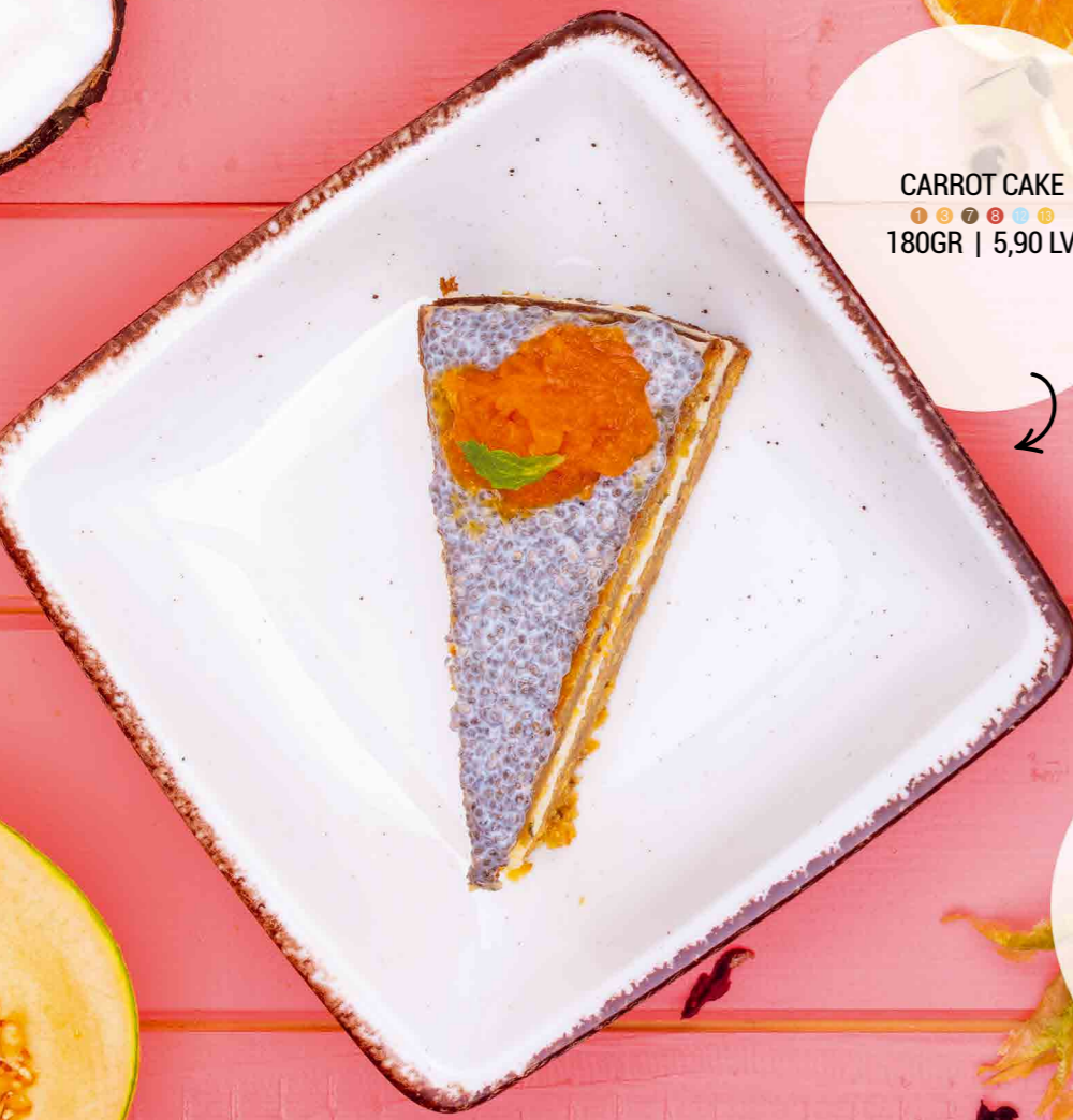
CARROT CAKE 180GR | 5,90 LV.