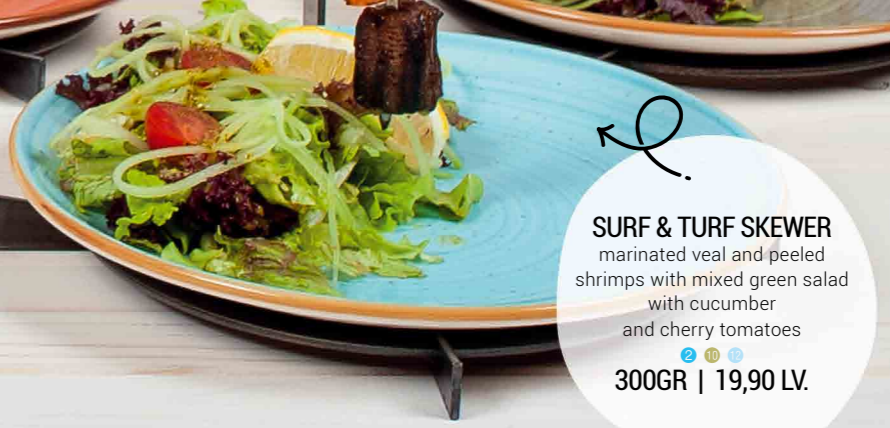
SURF & TURF SKEWER marinated veal and peeled shrimps with mixed green salad with cucumber and cherry tomatoes 300GR | 19,90 LV.