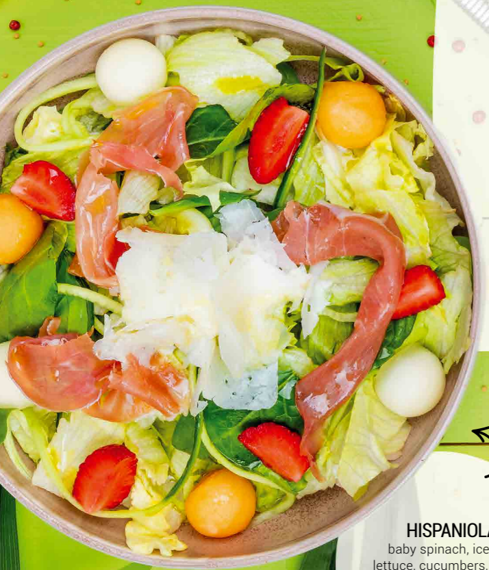
HISPANIOLA baby spinach, iceberg lettuce, cucumbers, melon, strawberries, jamon serrano, parmesan flakes and dressing 350GR | 12,90 LV.

NUMBER ONE 350GR 8,90 LV. peeled pink tomatoes, roasted pepper, marinated fresh cheese, kalamata olives