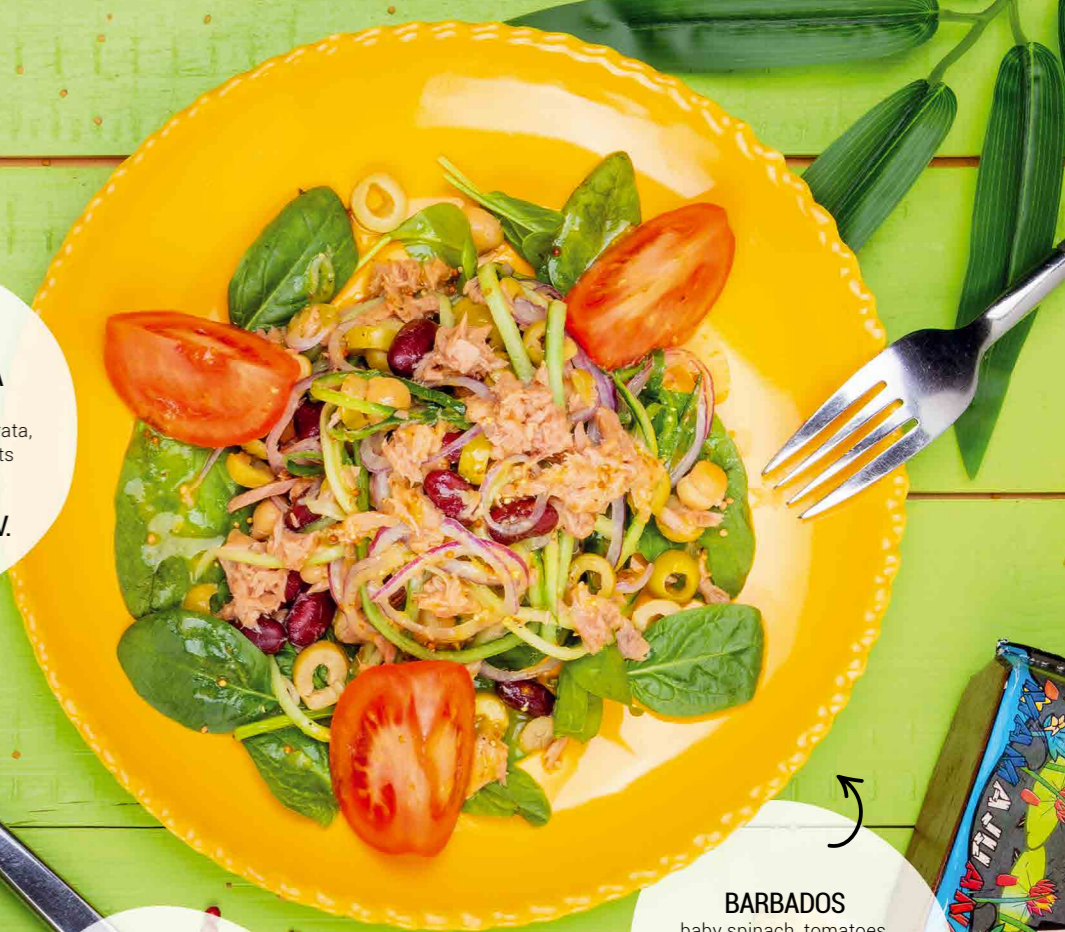
BARBADOS baby spinach, tomatoes, cucumber, tuna fish, red beans, chick peas, red onion, olives and dressing 350GR | 10,90 LV.