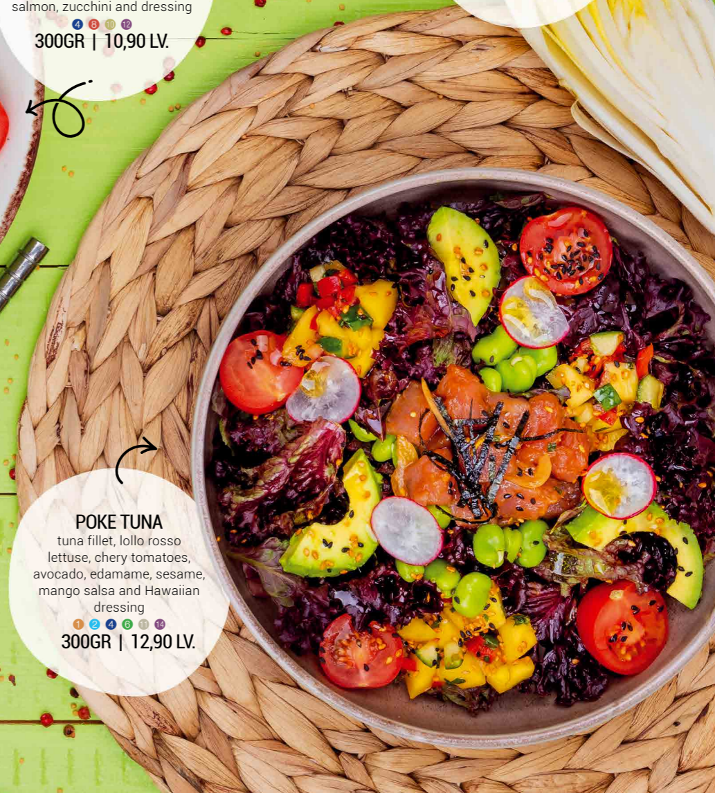
POKE TUNA tuna fillet, lollo rosso lettuce, chery tomatoes, avocado, edamame, sesame, mango salsa and Hawaiian dressing 300GR | 12,90 LV.