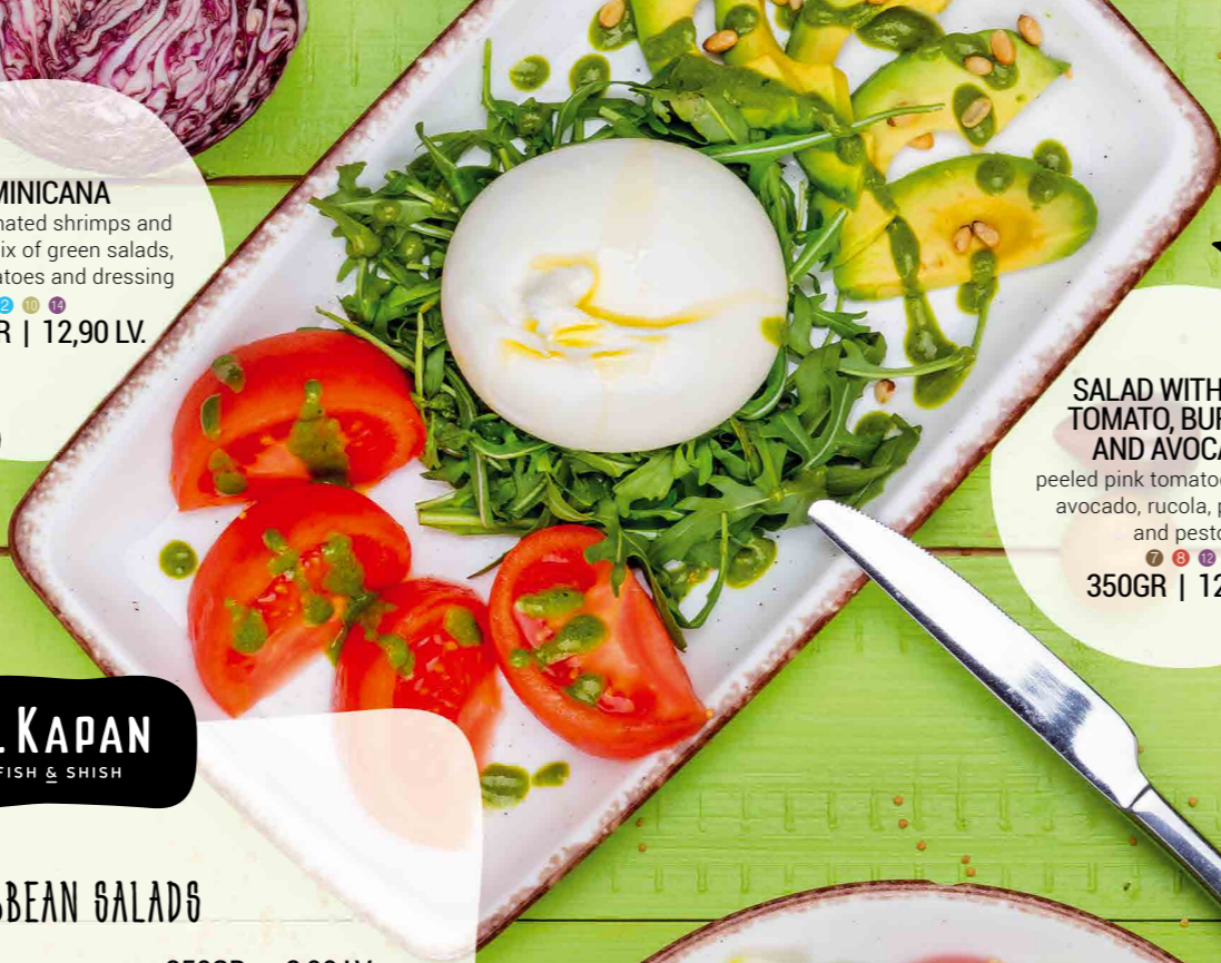
SALAD WITH PINK TOMATO, BURRATA AND AVOCADO peeled pink tomatoes, burrata, avocado, rucola, pine nuts and pesto 350GR | 12,90 LV.