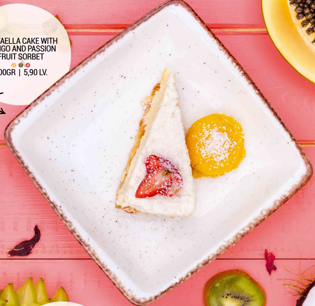
RAFFAELLA CAKE WITH MANGO AND PASSION FRUIT SORBET 200GR | 5,90 LV.