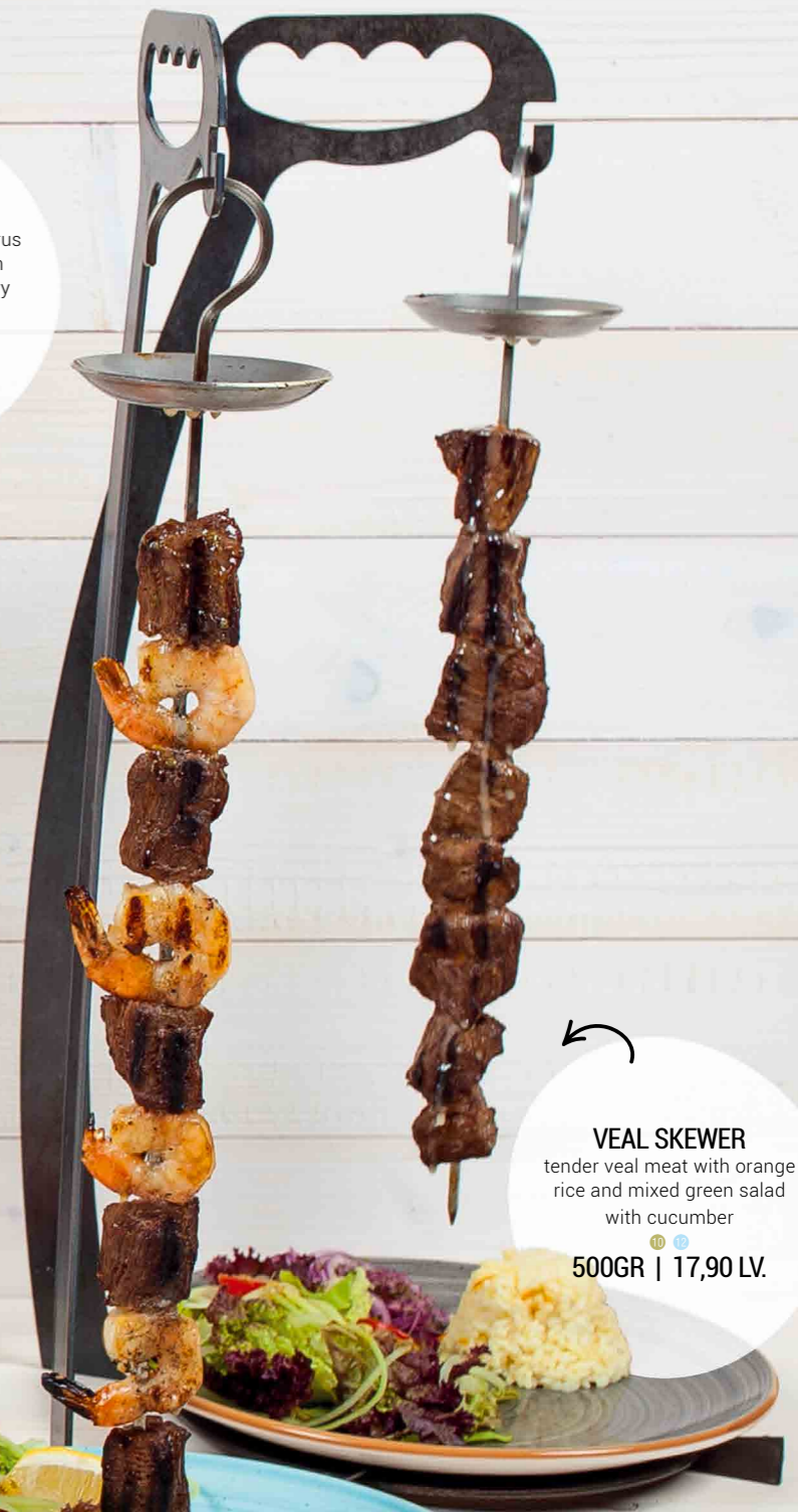
VEAL SKEWER tender veal meat with orange rice and mixed green salad with cucumber 500GR | 17,90 LV.