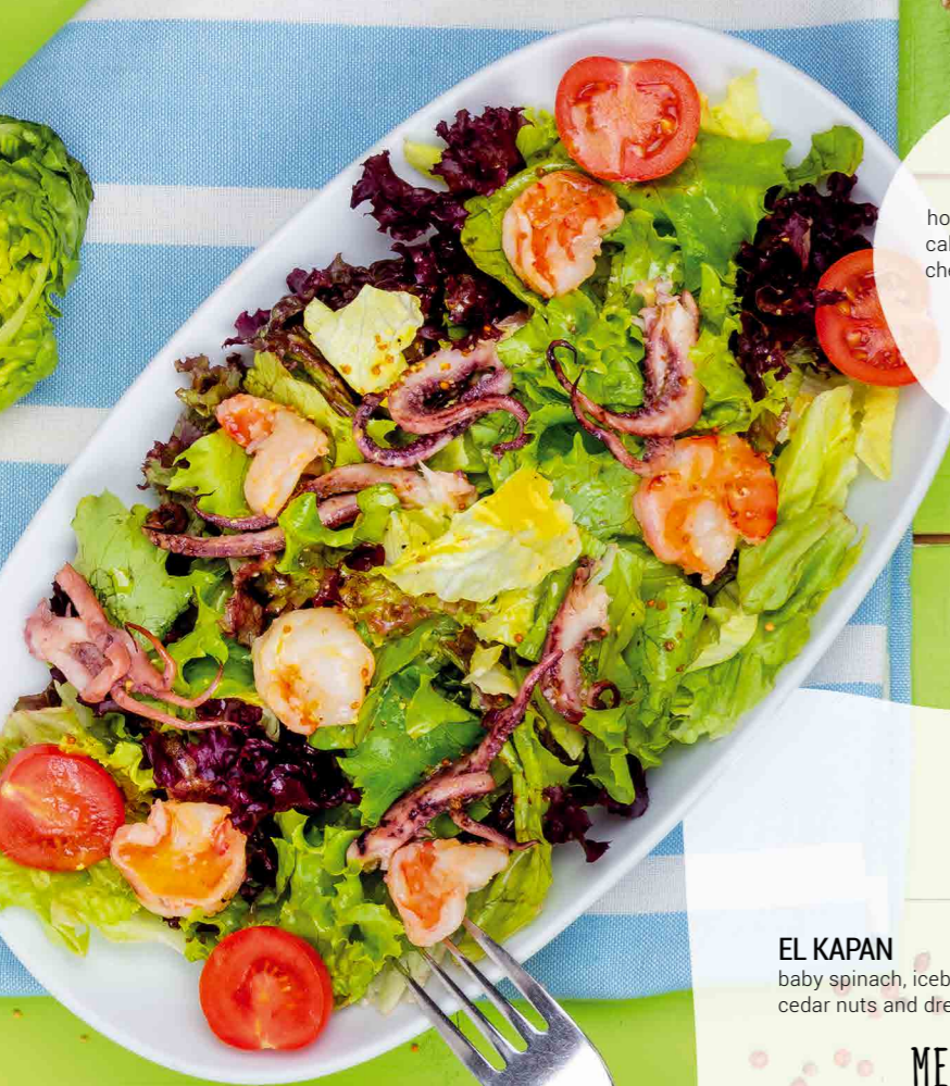
DOMINICANA home marinated shrimps and calamari, mix of green salads, cherry tomatoes and dressing 300GR | 12,90 LV.