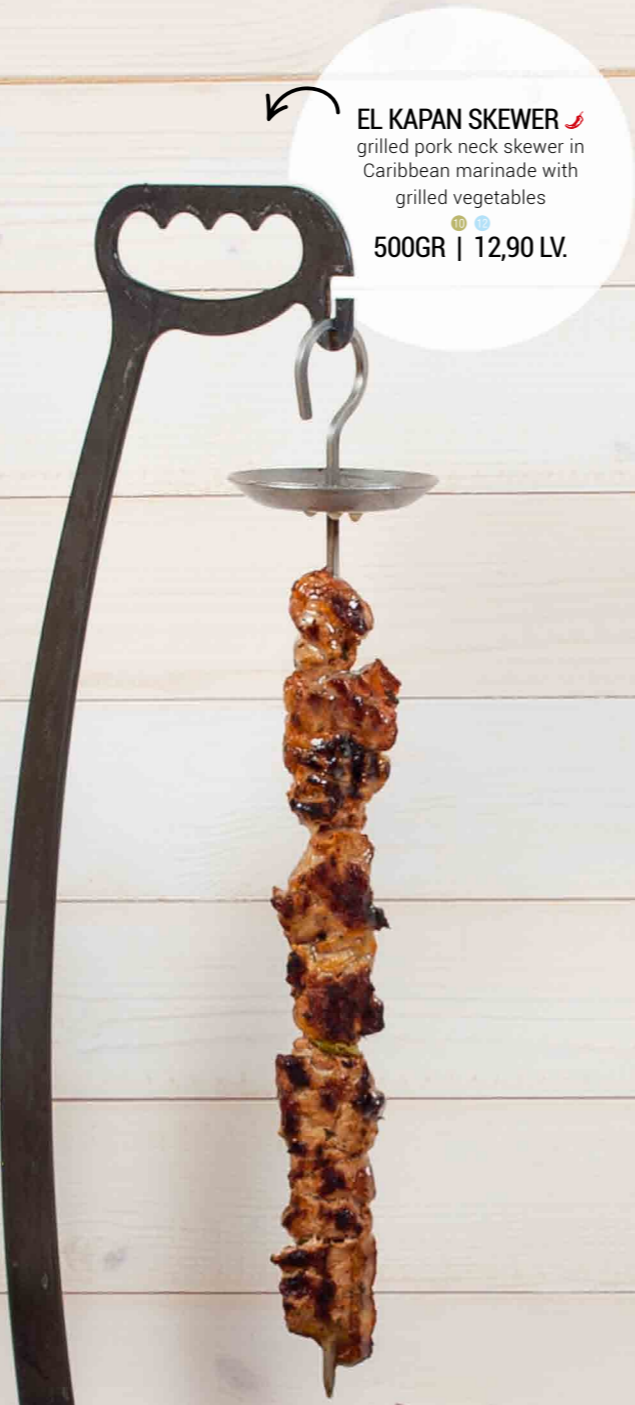
EL KAPAN SKEWER grilled pork neck skewer in Caribbean marinade with grilled vegetables 500GR | 12,90 LV.