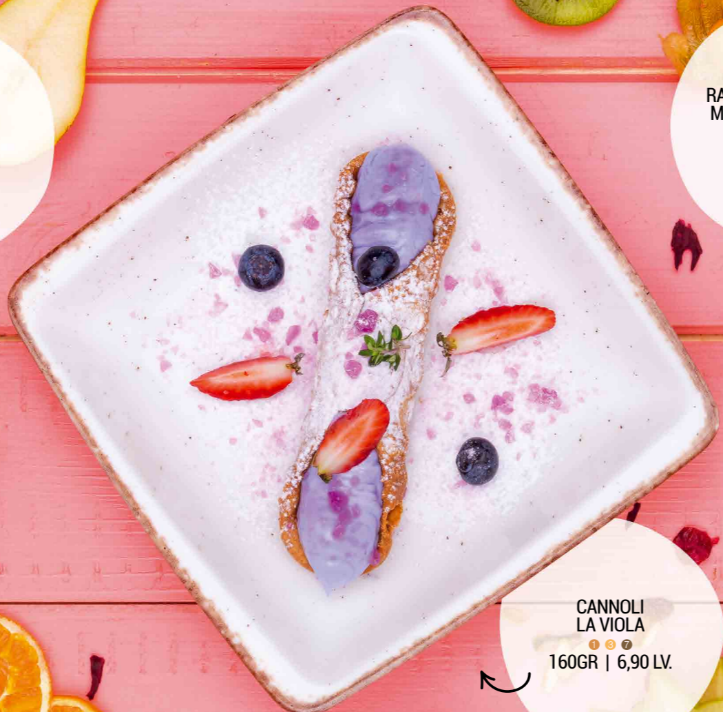
CANNOLI LA VIOLA 160GR | 6,90 LV.