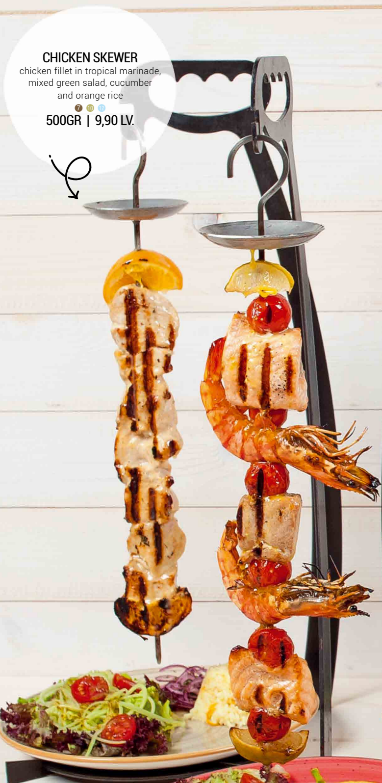
CHICKEN SKEWER chicken fillet in tropical marinade, mixed green salad, cucumber and orange rice 500GR | 9,90 LV.