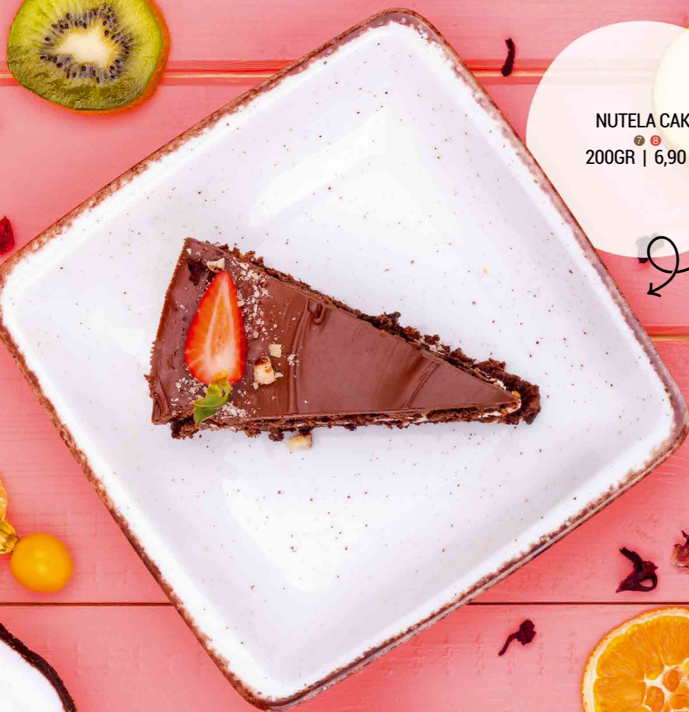
NUTELA CAKE 200GR | 6,90 LV.